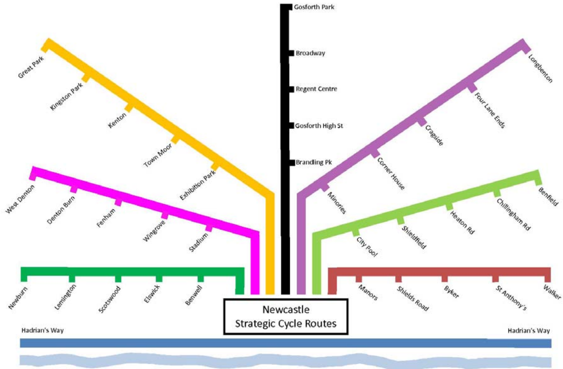
Fig.1 Seven Strategic Cycle Routes